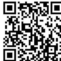
Requirement of Proctoring Device

Q: What should I prepare before the official exam?